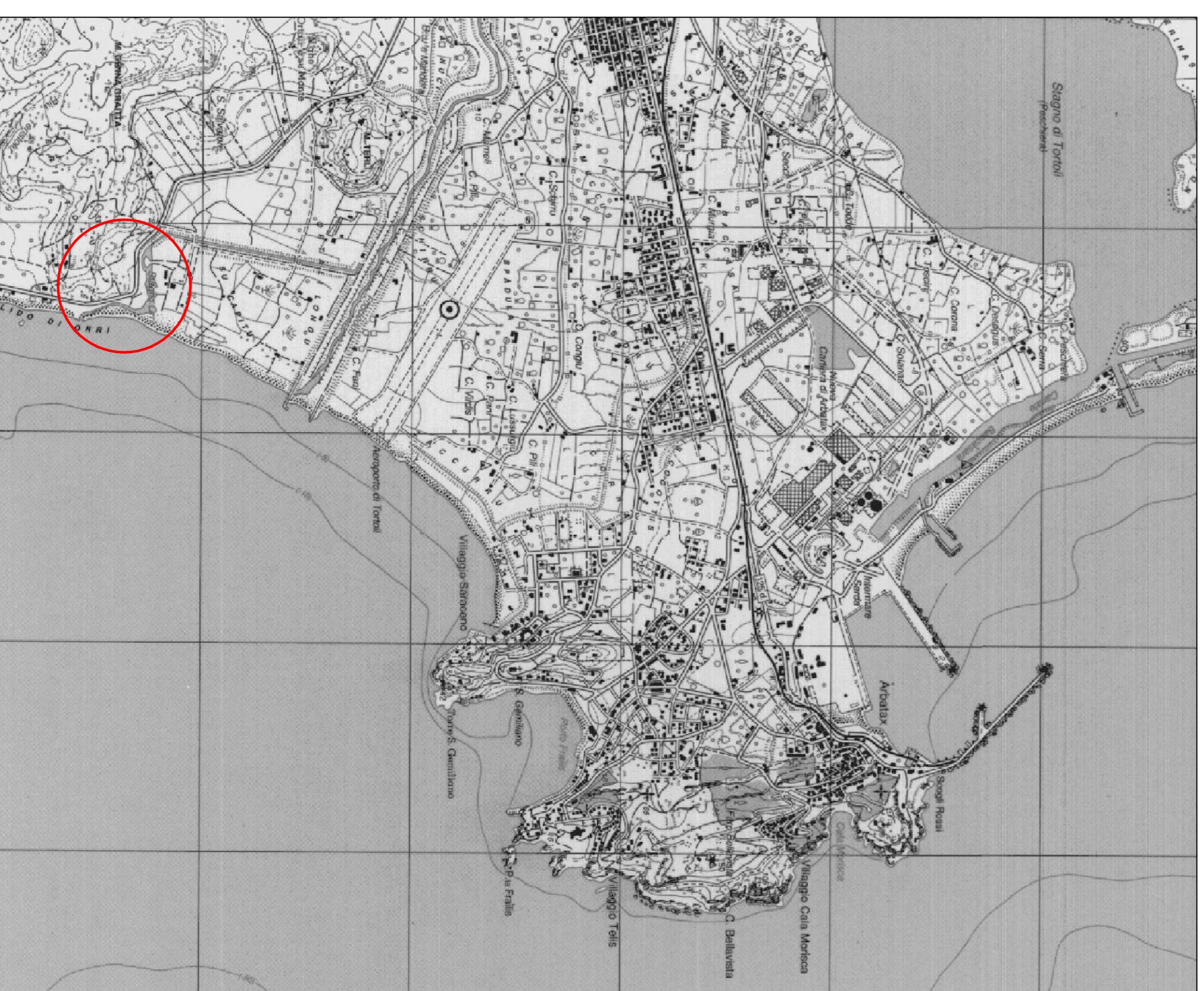
Stralcio IGM F. 532 sez.4. Scala 1:25000