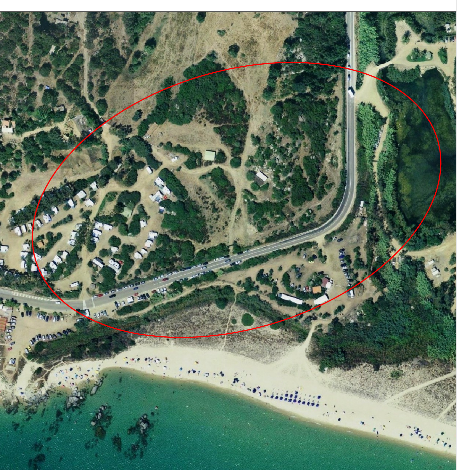
Ortofoto. Scala 1:5000